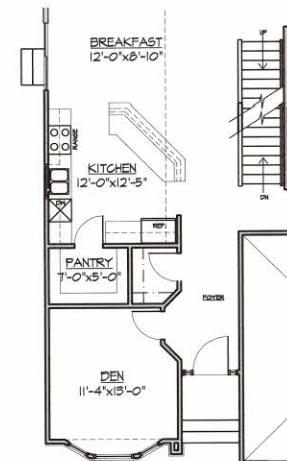
ALTERNATIVE FIRST FLOOR PLAN